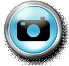
Share your pictures @ images.jostens.com

Note: The Yearbook Staff will review all photos and determine final yearbook content. We cannot guarantee that all submissions can be used in the book.